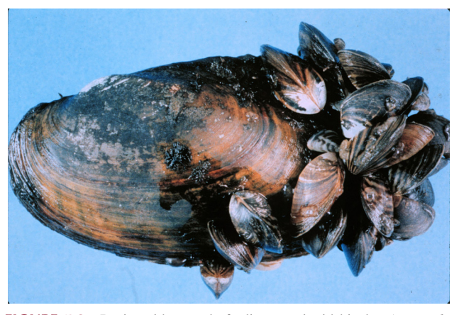
FIGURE 5.2 Dreissenid mussels fouling a unionid bivalve ( Lampsilis radiata ) from the St. Lawrence River.

In littoral areas, byssally attached mussels ( Dreissena and Limnoperna ) generally increase benthic community richness and biomass through provision of microhabitat (interstices of clumped shells), grazing surfaces (shells), and nourishment in the form of fecal/pseudofecal deposits (Ricciardi et al., 1997; Ward and Ricciardi, 2007; Burlakova et al., 2012). However, these invasive bivalves also exclude some species of invertebrates through resource competition and interference (Ricciardi et al., 1997; Lauer and McComish, 2001). Intense fouling of the exposed shells of native molluscs by dreissenids (Figure 5.2) causes negative impacts (Ricciardi et al., 1998; Van Appledorn et al., 2007; zu Ermgassen and Aldridge, 2010; Sousa et al., 2011), including severe population declines (Ricciardi et al., 1998).