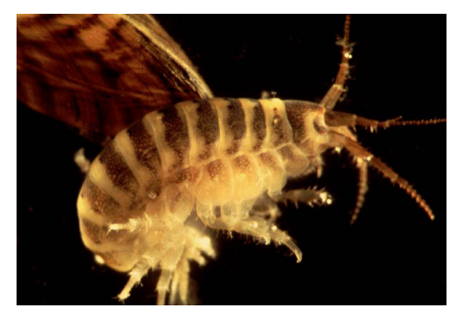
FIGURE 5.3 The killer shrimp Dikerogammarus villosus .

Introduced predatory invertebrates have caused conspicuous biodiversity loss in benthic and pelagic communities. The amphipod Dikerogammarus villosus, known as the "killer shrimp" (Figure 5.3), is a voracious predator of benthic invertebrates. It is rapidly eliminating native and alien gammarid populations from parts of western Europe (Dick et al., 2002), and these species displacements may have consequences for ecosystem functioning (MacNeil et al., 2011). The introduction of the Eurasian spiny water flea Bythotrephes longimanus Leydig, 1860, into Canadian Shield lakes has apparently resulted in rapid and persistent declines in native zooplankton richness (Boudreau and Yan, 2003). A similar predator, the fishhook water flea Cercopagis pengoi (Ostroumov, 1891), has invaded the Baltic Sea and the lower Great Lakes. Cercopagis feeds readily on small-body cladocerans; its population expansion during a 3-year period in Lake Ontario coincided with sharp declines in the abundance of dominant members of the zooplankton community, including two daphniid species that have been observed to be preyed upon by C. pengoi in lab experiments. One of these