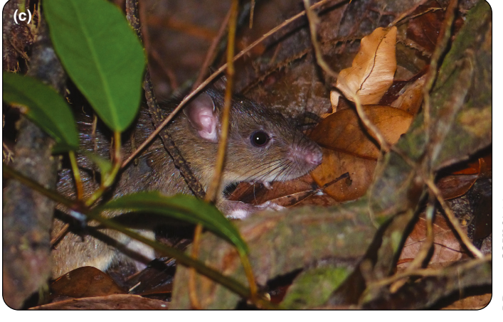
Dupont; CC BY-S.