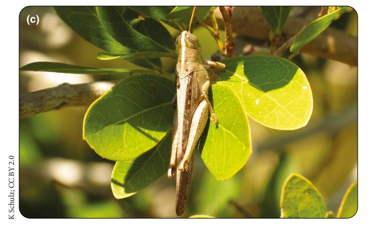
Figure 3. Native species cited as contributing to the extinction of species on the IUCN Red List (categories EX or EW). (a) Purple sea urchin ( Strongylocentrotus purpuratus ), which has been implicated in the extinction of Steller's sea cow ( Hydrodamalis gigas ). Human hunting of sea otters ( Enhydra lutris ) led to a population explosion of sea urchins, including S purpuratus , which in turn largely eliminated the kelp on which Steller's sea cows fed (IUCN 2017). (b) Aldabra tortoise ( Geochelone gigantea ), which has been implicated in the extinction of the Aldabra brush-warbler ( Nesillas aldabrana ). (c) Outbreaks of the locust Schistocerca piceifrons (shown here in the Celestún Biosphere Reserve, Yucatán, México) have reduced the extent of prime habitat for the Socorro dove ( Zenaida graysoni ), which is now extinct in the wild (IUCN 2017).

biological resource use) across all species assessed by the IUCN, and the driver most frequently associated with vertebrate extinctions (Bellard et al. 2016a). The present analysis uses updated IUCN data from a broader range of taxa and reveals that alien species are now the primary extinction driver of both animal and plant extinctions, pushing biological resource use into second place. This may be due in part to the inclusion of extinctions in a range of taxa not analyzed by Bellard et al. (2016a) for which alien species have been the primary extinction driver (eg Arachnida, Diplopoda). Aside from birds, the proportion of extinctions ascribed to alien impacts in the taxa analyzed by Bellard et al. is lower in the updated IUCN data (compare Figure 1 with Table 1 in Bellard et al. 2016a).